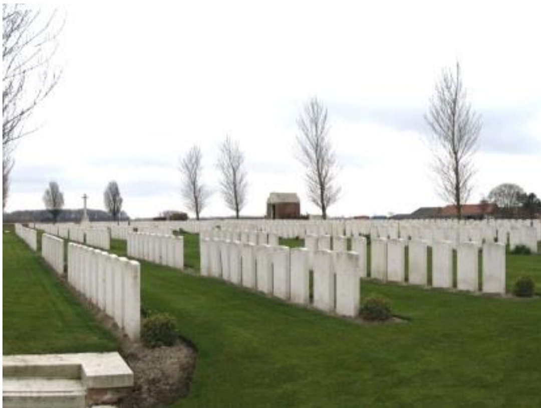
Aeroplane Cemetery, Ypres